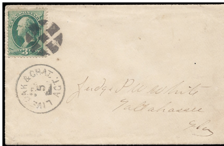
381-E-1, Jun 5 th date