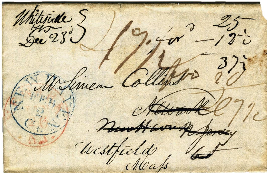
Figure 1. December 23, 1838, Type 1 manuscript Whitesville letter.